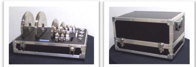
Suitcase for post planning and transportation

(OP0101) : 260 x 260 x 310 mm - weight empty : 6 kg