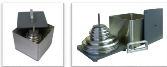
transport metal boxes

(OP0101) : 260 x 260 x 310 mm - weight empty : 6 kg