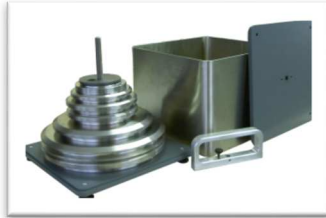
transport metal boxes

(OP0101) : 260 x 260 x 310 mm - weight empty : 6 kg