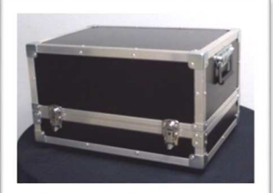
Suitcase for post planning and transportation

(OPxxxx) large : 355 x 505 x 310 mm - weight empty : 13 kg